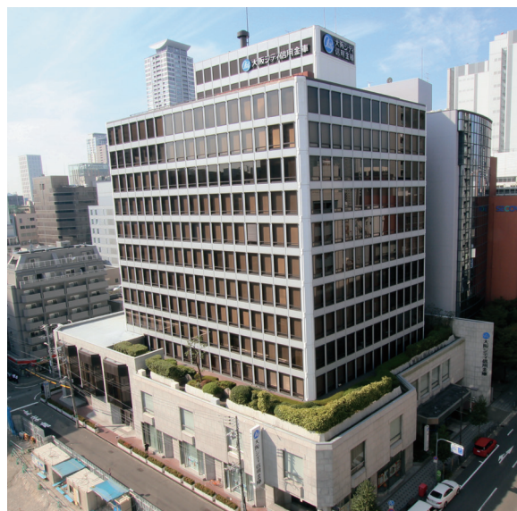
▲ Head Office

Head Office 2-5-4 Kitahama, Chuo-ku, Osaka 541-0041, Japan Tel: +81-6-6201-2881 International Department 2-5-4 Kitahama, Chuo-ku, Osaka 541-0041, Japan Tel: +81-6-6201-5398 Fax: +81-6-6226-4059 SWIFT Address: OSACJPJS