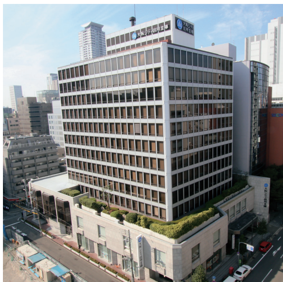
▲ Head Office