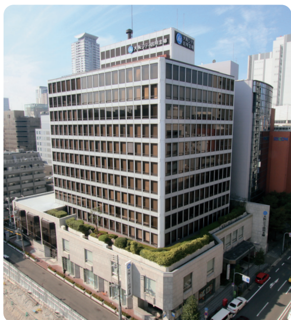
▲ Head Office